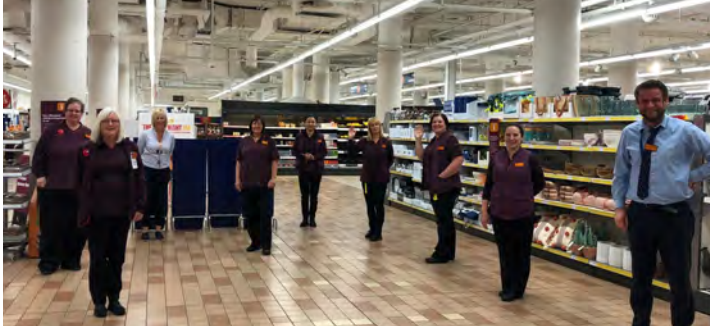
Thank you Sainsbury's in Grosvenor Shopping Centre Northampton for the generous food donations.

As a local independent charity we get no central funding and depend on donations and the support of the people of Northamptonshire to keep going. We continue to be hugely grateful to the many local businesses, organisations and individuals who have supported us during these difficult times. If you or your business is not mentioned here, please rest assured your donation is very much appreciated.