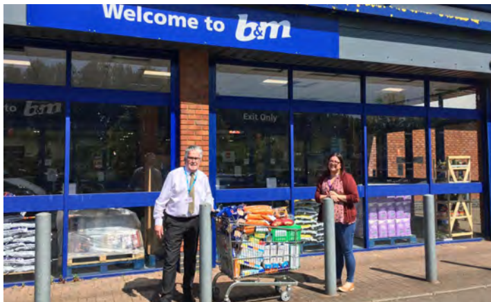
A huge thank you B&M's Towcester store for choosing us to receive a £1,500 donation from their company's £1m Food Bank Donation Programme. The money was used to buy essential groceries, cleaning products and toiletries for older people who had no support locally and were struggling to manage in the early weeks of the Lockdown.