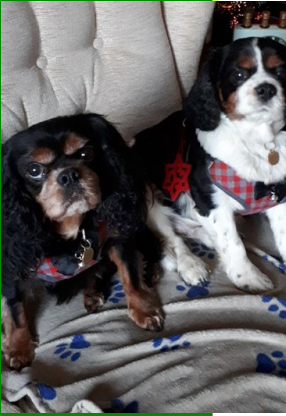
For all owners of fur and feather babies, past and present