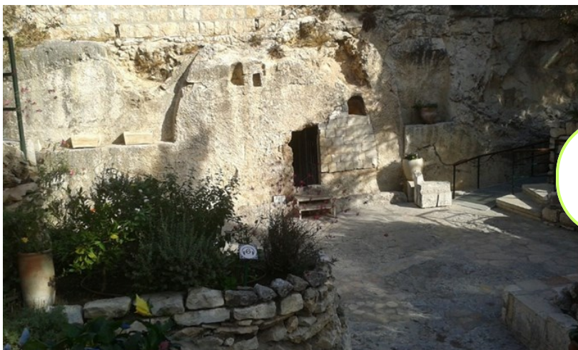
The Garden Tomb Jerusalem

Quite perplexing until you realise that our God is the God of miracles. If human beings in their sinful misguidedness have spoilt the place where the greatest of all miracles happened God has given us a reminder of what the resurrection was all about. It points us to a place not restricted by the physical confines of time and space that we are familiar with in this world. It reminds us of a new creation with everything restored to the perfection which God intended for us from the beginning. If the Church of the Holy Sepulchre offends the senses and speaks of the corruption of the world the Garden Tomb speaks to us of birdsong and sunlight, peace and the promise of eternity in the presence of God. The God who makes all things new.