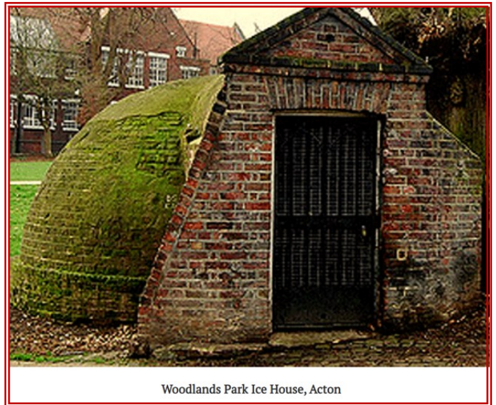
Woodlands Park Ice House, Acton

*Ice House Approximately 20 Metres North East of Church of the Holy Trinity. A Grade II Listed Building in Blatherwycke, Northamptonshire.