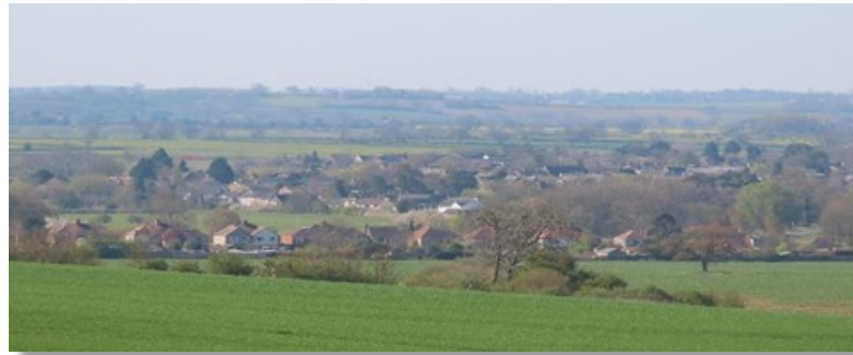
Panoramic view across Nene Valley

Starting at the edge of Duston, just opposite the bus stop in Berrywood road, take the path that runs south, down the side of the estate. Approaching the first large tree, step through the hedge.