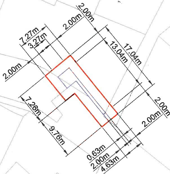
SITE PLAN (SCALE 1:500)